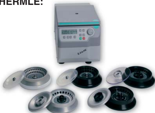
Refrigerated Microlitrecentrifuge 2216 MK